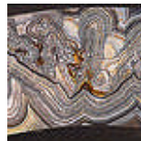
Crazy lace agate